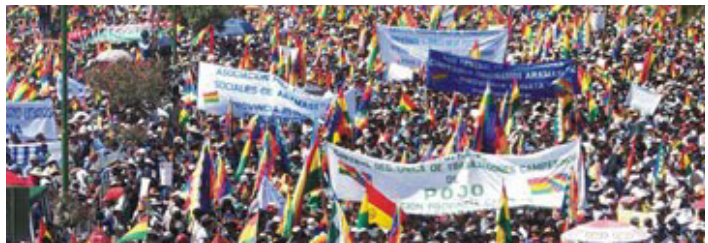
Cochabamba resists water privatisation, 2000.

The "Our Water is Not for Sale" Forum will bring together activists opposed to charges, environmental and anti-capitalist campaigners from Ireland and Europe as well as leading campaigners from South America to discuss the wider politics of water and privatisation, we will consider how they relate to climate change and other environmental issues, and crucially, we will focus on developing strategies of resistance.